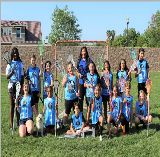
Girls Team 2022

If you are interested in finding out more about Delta Breeze Lacrosse, go to their website at https://www.dblax.com/ .